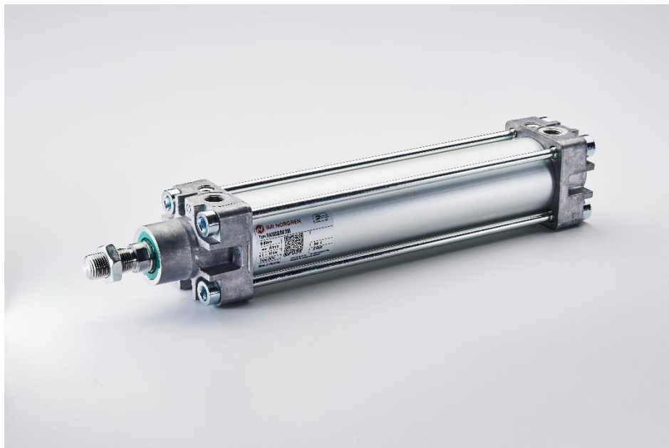
Caption 2: Pneumatic actuator by IMI Precision Engineering.

This press release and accompanying images are available for download from our website: www.cadenas.de/press/press-releases